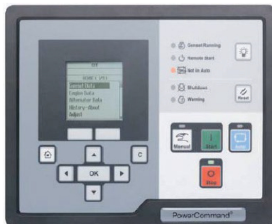
PowerCommand 2.2 control operator/Display panel

Note: Please, refer to PC2.2 product literature for additional Information on Control System.