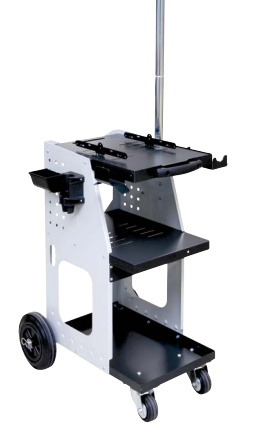
PN. 051331 + 052284 UNIVERSAL 800 + Over hanging arm