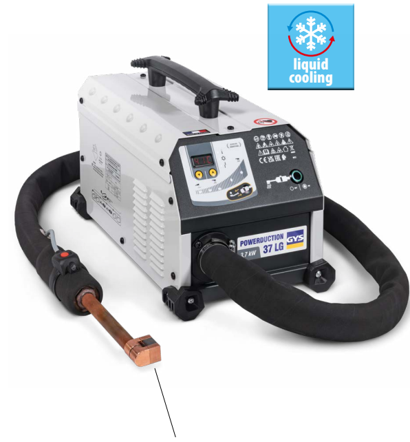
Supplied with a complete inductor 90°