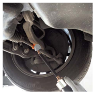
Releases steering linkages