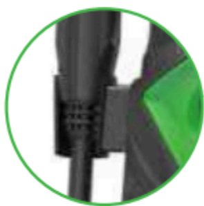
Porta lancia Spear holder