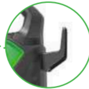
Porta cavo Cable holder