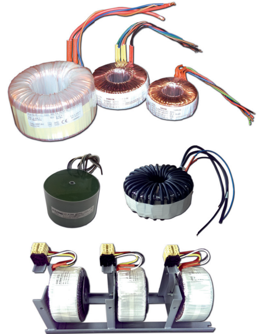
Customized items on customer's request