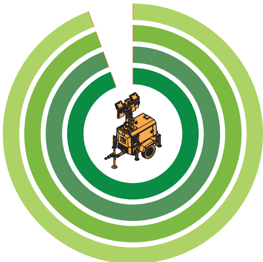
40'' HC container