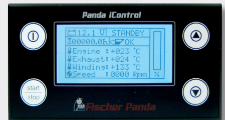
Panda iControl digital display