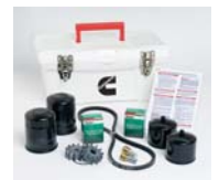
Cummins Onan Cruise Kit