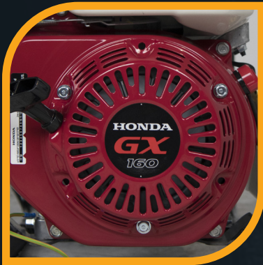
Honda GX 160 Engine