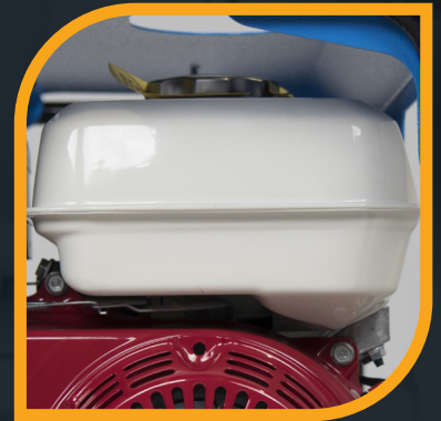
3,1 Lt Fuel Tank