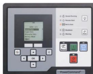
PowerCommand 1.2 control operator/Display panel

Note: Please, refer to PC1.2 product literature for additional Information on Control System.