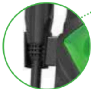
Porta lancia Spear holder