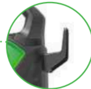
Porta cavo Cable holder