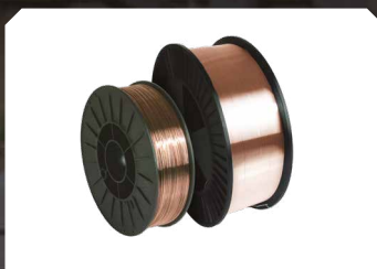
■ Steel wire (SG2) ■ Stainless steel wire (316LSi)