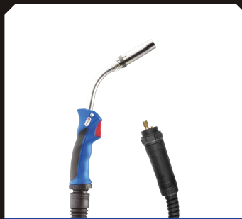
Steel / Stainless steel MIG / MAG torch