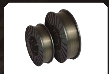
Steel flux-cored wire