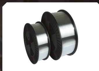
Aluminium wire (AlMg5)