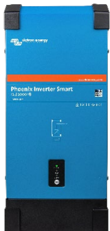
Phoenix Inverter Smart 12/2000