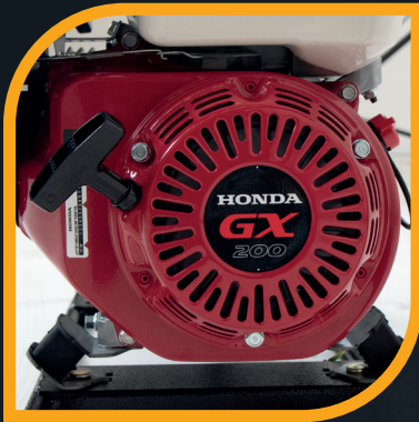
Honda GX 200 Engine