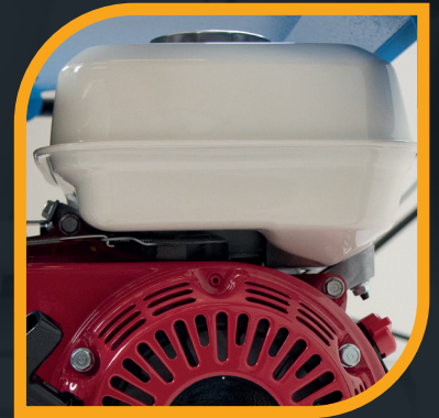
3,1 Lt Fuel Tank