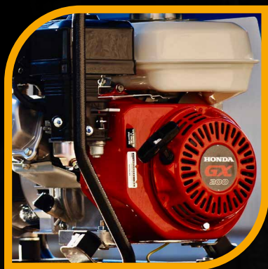
Honda GX200 Engine