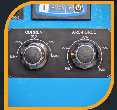
Welding settings knobs